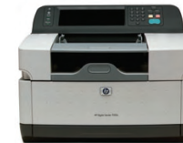
HP 9200c Digital Sender Part # Q5916A