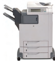
HP LaserJet M4345 MFP Part # CB425A HP LaserJet M4345x MFP Part # CB426A HP LaserJet M4345xs MFP Part # CB427A HP LaserJet M4345xm MFP Part # CB428A