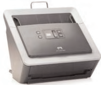
HP Scanjet 7800 Scanner Part # L1980A