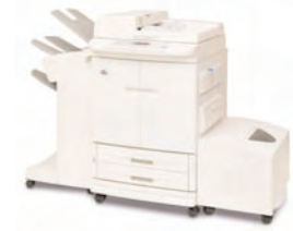
HP LaserJet 9040 MFP Part # Q3726A HP LaserJet 9050 MFP Part # Q3728A