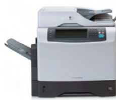
HP LaserJet M3035 MFP Part # CB414A HP LaserJet M3035xs MFP Part # CB415A