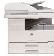
HP Color LaserJet 4730 MFP Part # Q7517A HP Color LaserJet 4730x MFP Part # Q7518A HP Color LaserJet 4730xs MFP Part # Q7519A HP Color LaserJet 4730xm MFP Part # Q7520A