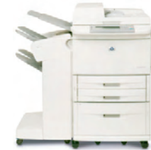
HP LaserJet 5035 MFP Part # Q7829A HP LaserJet 5035x MFP Part # Q7830A HP LaserJet 5035xs MFP Part # Q7831A