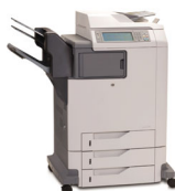
HP Color LaserJet 4730mfp