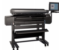
HP Designjet 820mfp