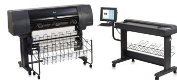
HP Designjet 4500mfp