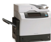
HP LaserJet 4345mfp