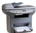
HP LaserJet 3000 All-in-One series