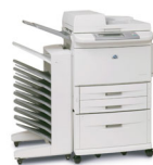
HP LaserJet 9050mfp