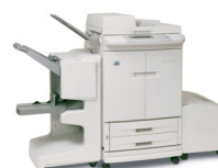
HP Color LaserJet 9500mfp